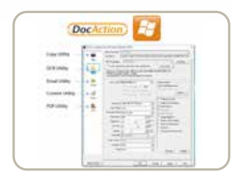
Windows & Mac OS available