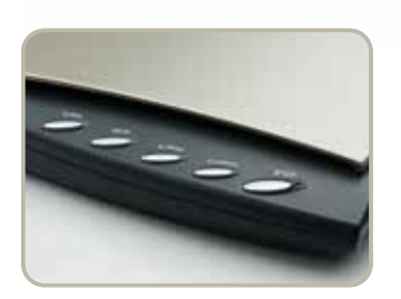
5 One-Touch Quick Action Buttons

With Specialized Lid Design,OS2610 help you easy scan large items such as personal notebook or thick document.