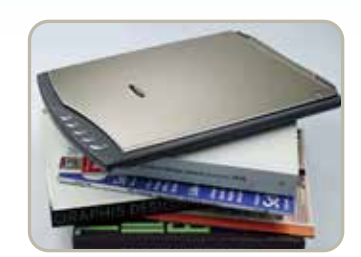
Smart and stylish design