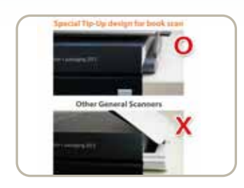
Special designed hinges with Lid